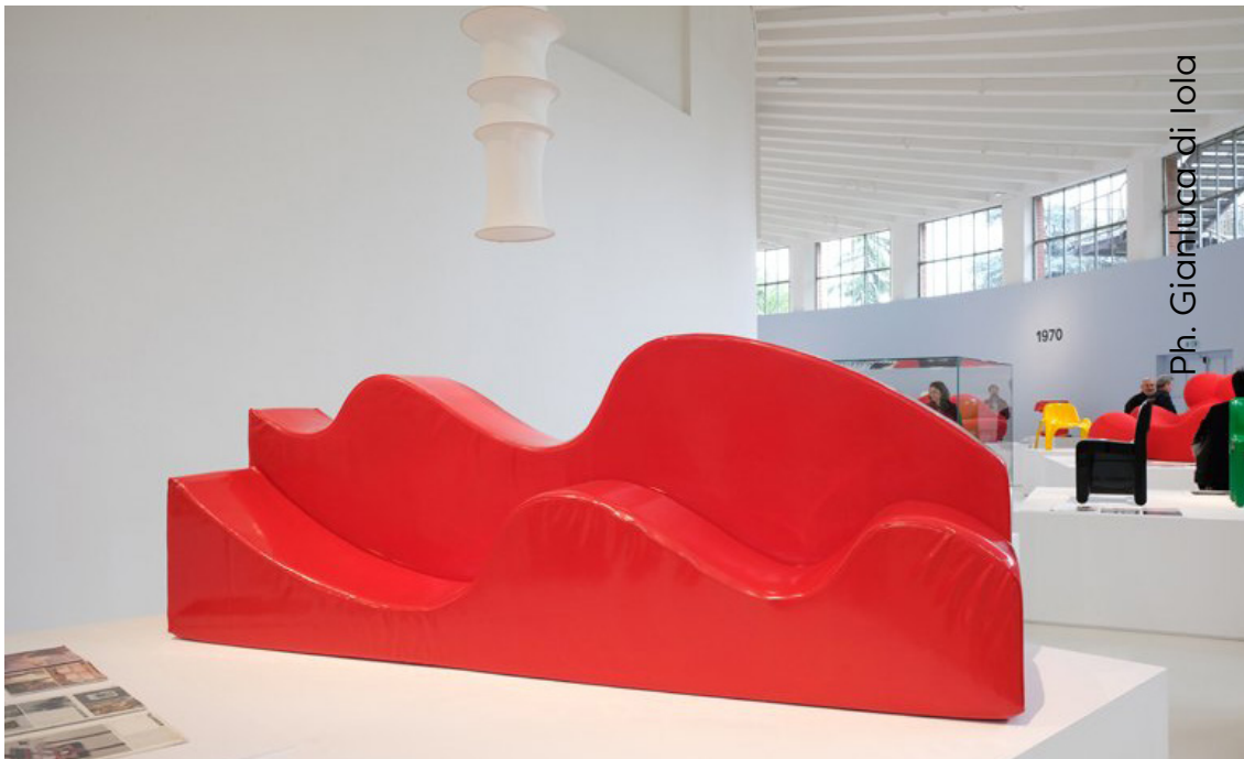
↷ Triennale Design Museum permanent collection, Milan.