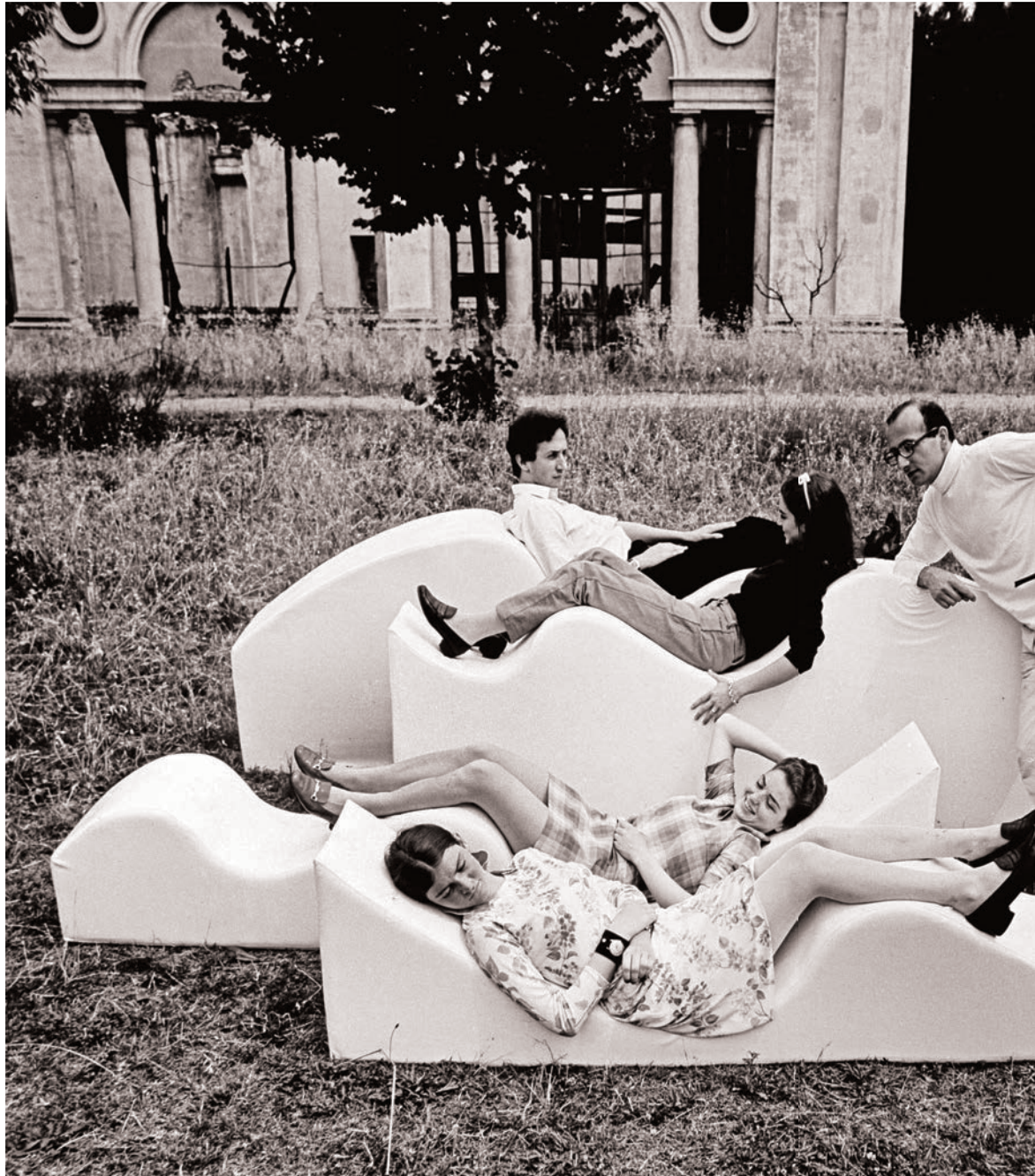
↳ Archizoom Associati with Superonda, Villa Strozzi Garden. 1966