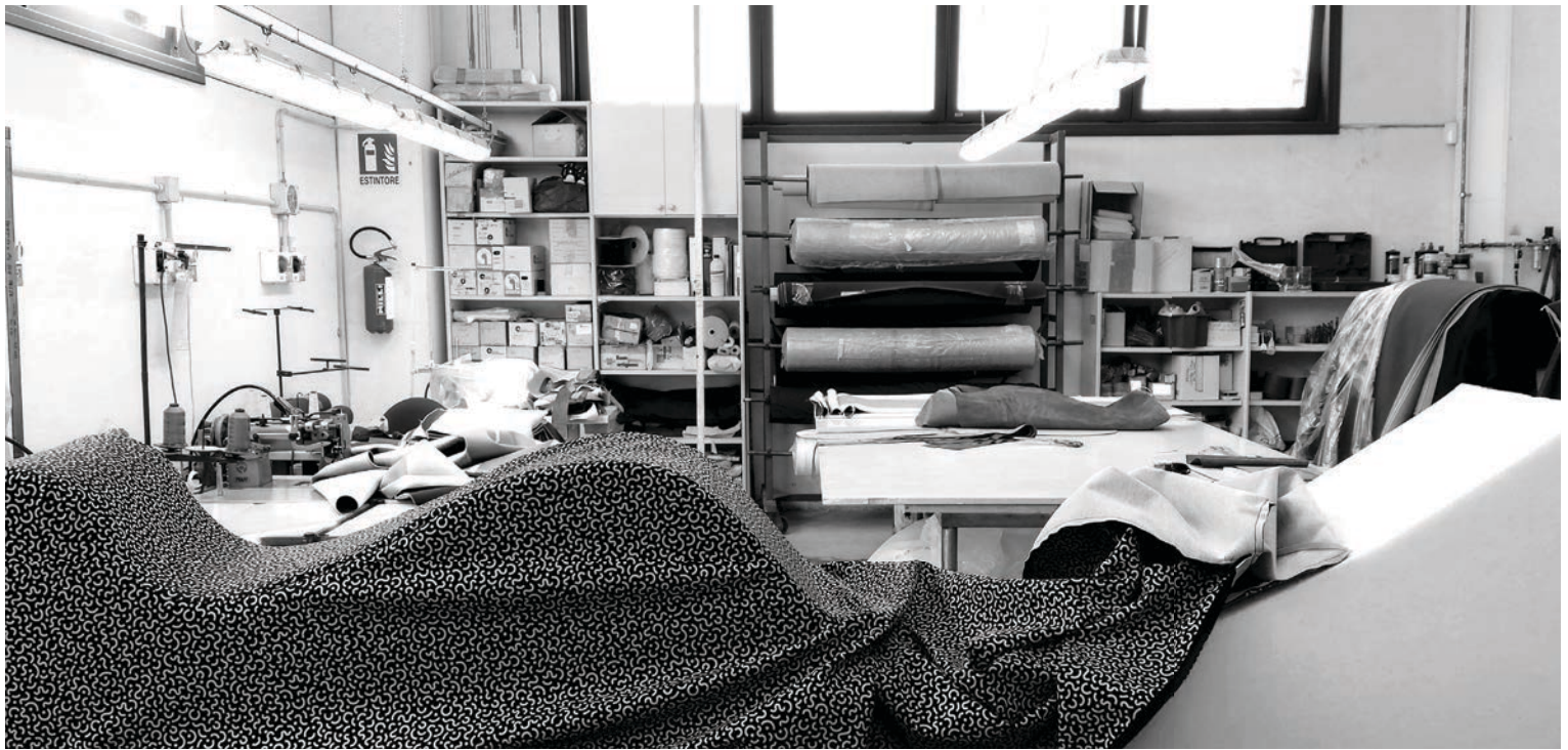
Poltronova factory, Agliaana. 1967—2020